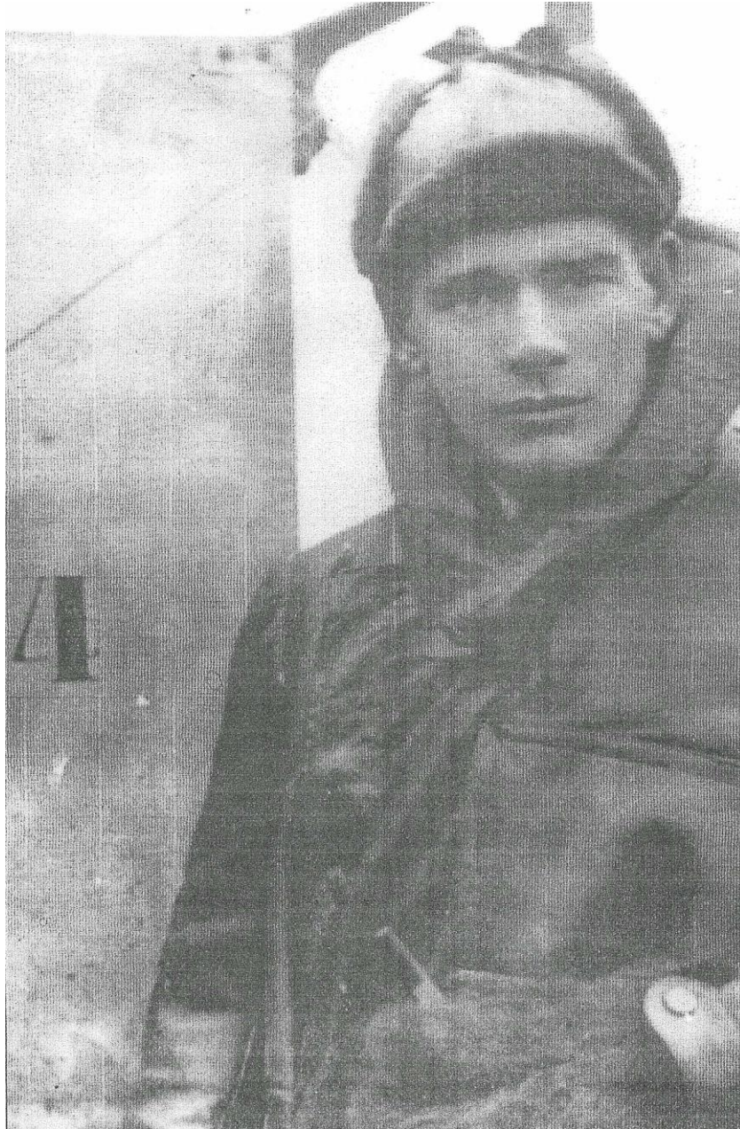
20 Mick Mannock