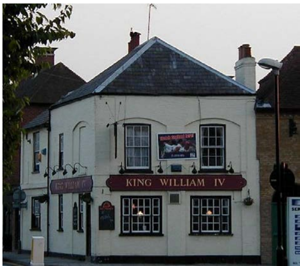
the pub in Union Street in June 2001 21