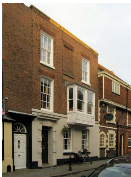
BUF shop and office was here in 1939 (6 St Alphege Lane)