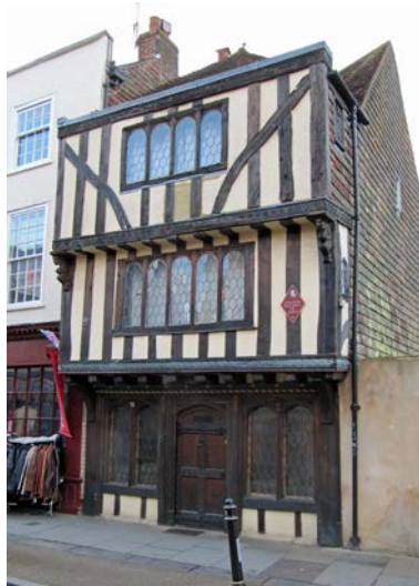
the Tudor House in Palace Street