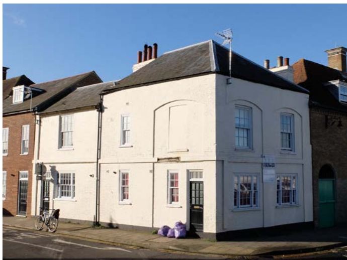
now converted to student accommodation

One feature of the legal processes surrounding Detention Regulation 18B cases was the guarantee of anonymity to all informants. This inevitably encouraged snooping on workmates, acquaintances and neighbours, some of which was later shown to be malicious or simply absurd. A Mrs Robert Burk, living in Herne Bay, was surprised when police demanded to search her home. They seemed pleased when they found a paper message referring to 'back Italian' - surely evidence of a seamstress running up black shirts for BUF members. It turned out that 'black Italian' was routinely sold by a local draper as an effective black-out fabric. One anonymous informant had been over-zealous in their patriotism.