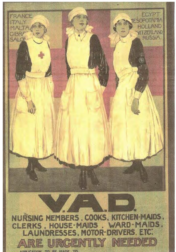
14 VAD poster