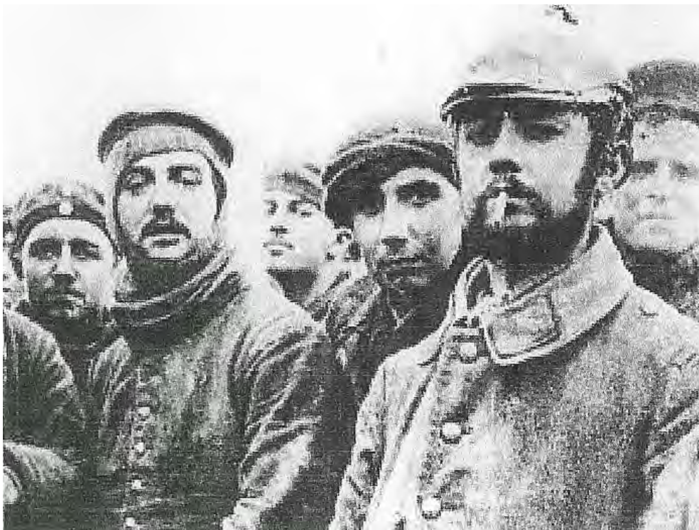
16 Christmas truce at the front

Last night (Christmas Eve) was the weirdest stunt I have ever seen. All day the Germans had been sniping very industriously with some success, but after sunset, they started singing and we replied with carols. Then they shouted "Happy Christmas" to us and we replied in German. It was a topping moonlight night and we carried on long conversations, and kept on singing to each other and cheering.