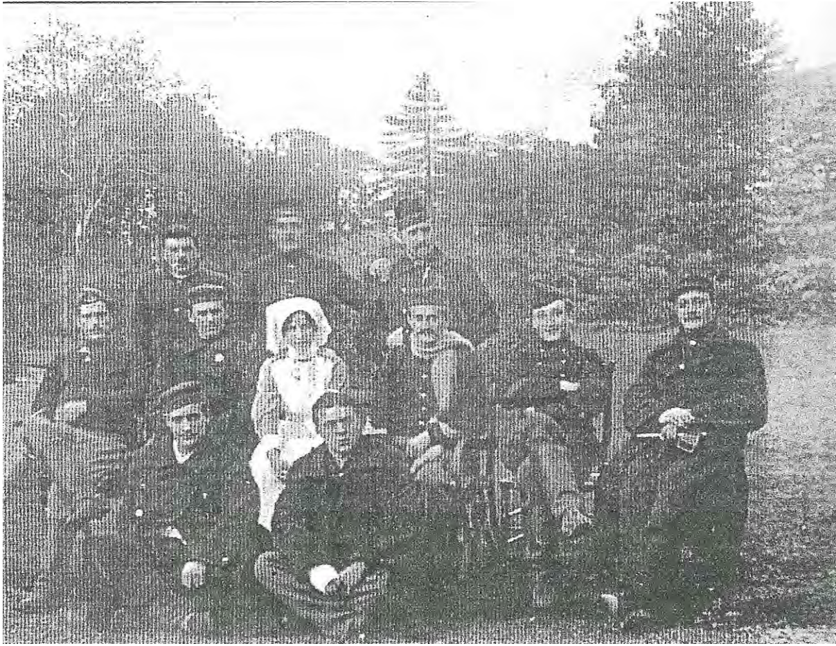
13 Belgian soldiers at Abbots Barton