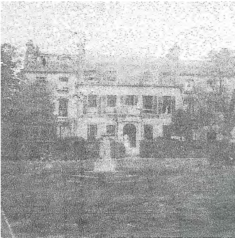
12 The Dane John VAD hospital